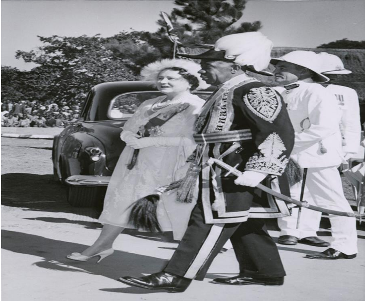
Figure 3. The Queen Mother of Briatin visit to Barotseland in 1960. His Majesty King Mwanawina III, with the Queen Mother in 1960. This image illustrates what official state visits imply. In the context of this paper and the criteria for the 1933 Montevideo Convention on Statehood, this visit by the Queen Mother exhibits the ability of Barotseland before the Barotseland Agreement to engage in foreign relations.