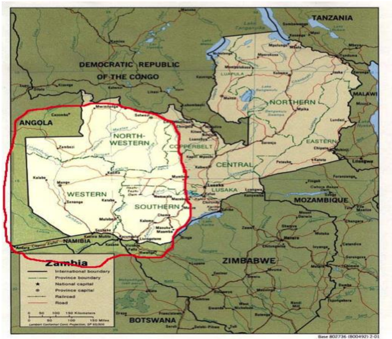
Figure 1. The Territory of Barotseland. This image demonstrates the territory Barotseland encompassed.